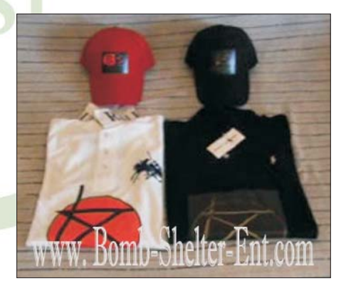
Cloths print & Embroidery