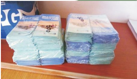
Brochures & Flyers