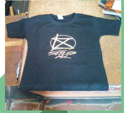
Corporate Bush & Office shirt, Golf/ Polo & T-shirts (in reg. colors)