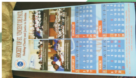
Calendars & Posters