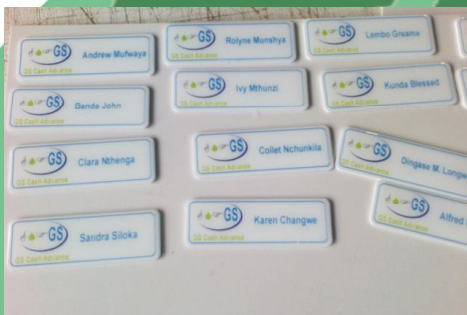
Magnetic/ Laminate Ids