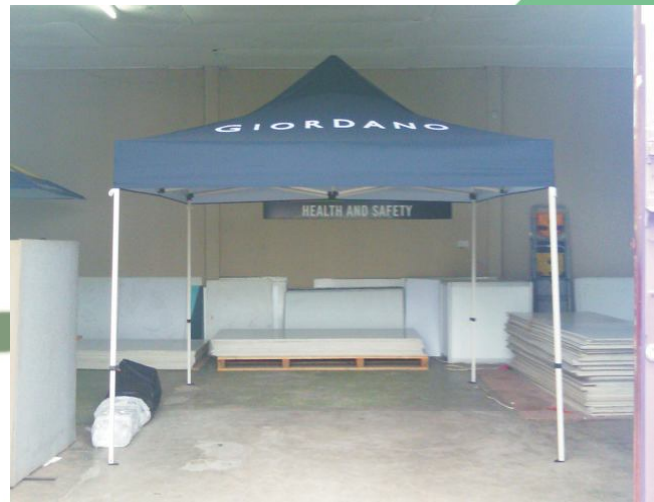
Fully Branded Gazebos @ 2.5x2.5m 3x3m & 3x4.5m with or without walls