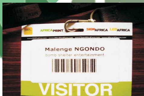
Name Tags & Strapping